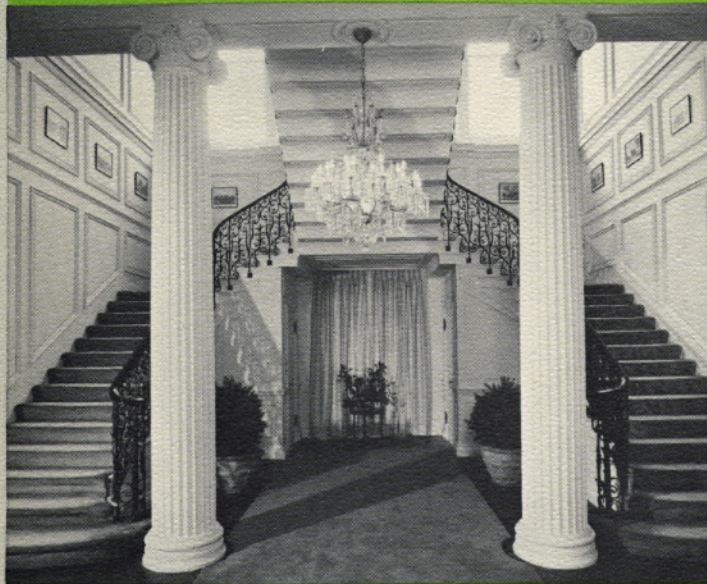
FORMAL ENTRANCE HALL